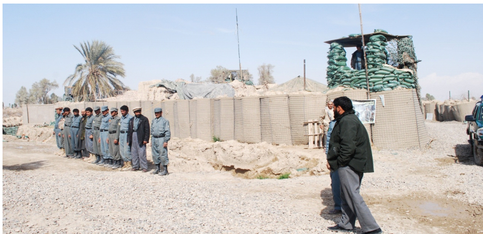
Figure 4. Omar Jan, Garm Ser district police chief, inspecting a patrol base with police and arbakai guards in March 2011 a

One way to get the benefits of local and non-local police is to have locally recruited police patrolmen serving under officers from other areas (figure 4). If these officers are willing to engage with the local leaders and the public, they may be able to make objective decisions while also understanding local issues.