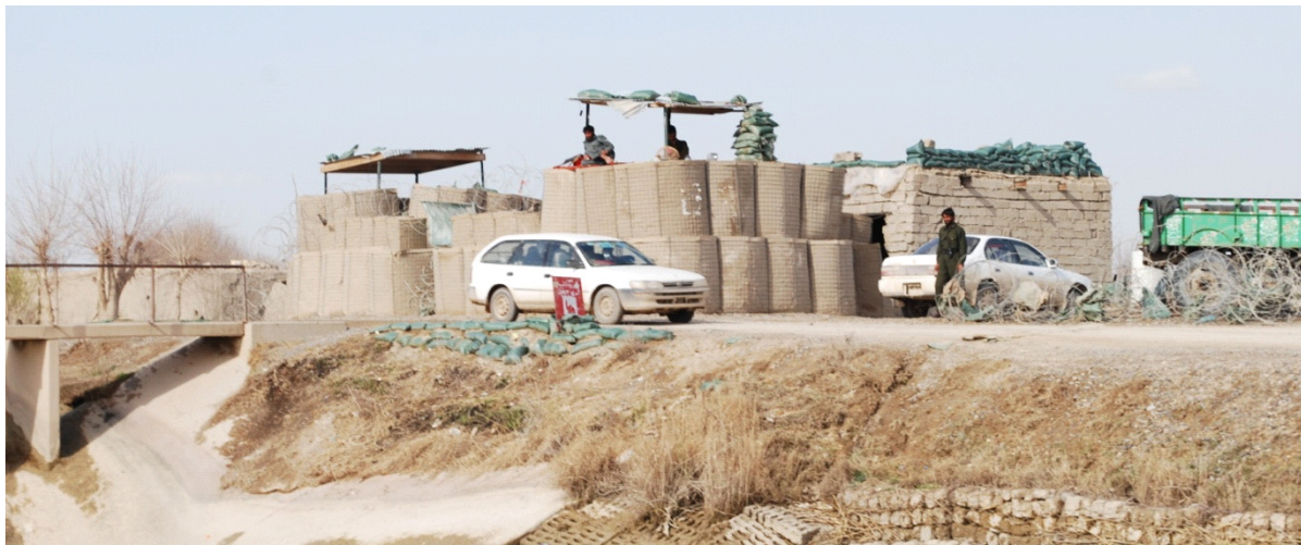
Figure 2. Police checkpoint along a main road through Garm Ser district, February 2011 a

River Valley and in much of northern Helmand. As shown in figure 2, however, these “checkpoints” are nothing like the temporary sobriety checkpoints police set up in America. Instead, police mentors interviewed for this study used the terms “patrol bases” and “checkpoints” interchangeably to mean fixed positions with permanent buildings where 10 to 20 police live and work. These positions include living quarters, an area for cooking, and a latrine, and they are called “checkpoints” because most of them are located along main roads or at entrances to bazaars or schools so the police can search passing vehicles for IEDs, weapons, or drugs. As “patrol bases,” these positions also provide the police with staging grounds for conducting police patrols.